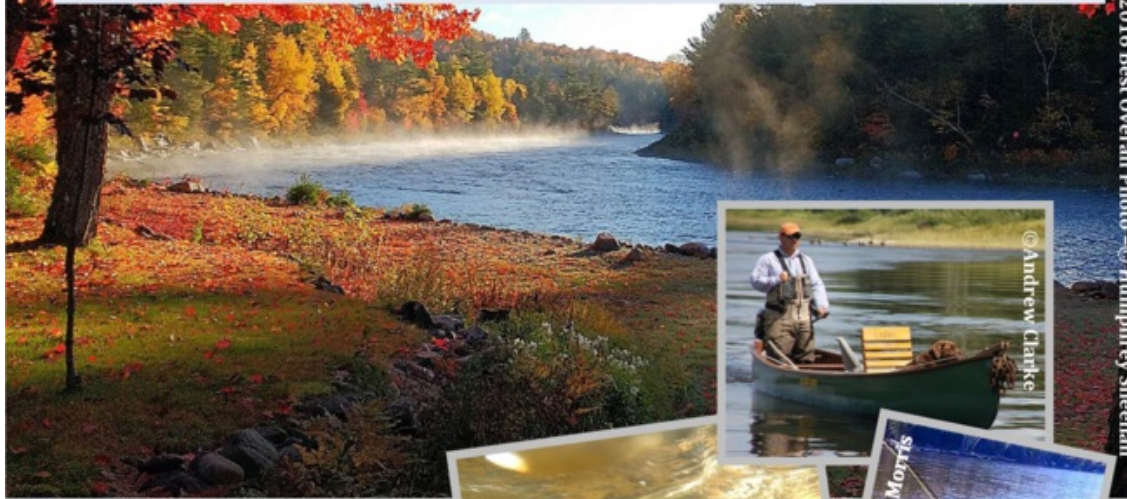
2016 Best Overall Photo