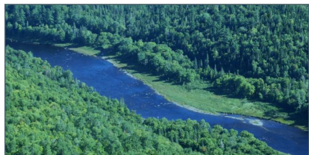
Featured below: Salmon Brook