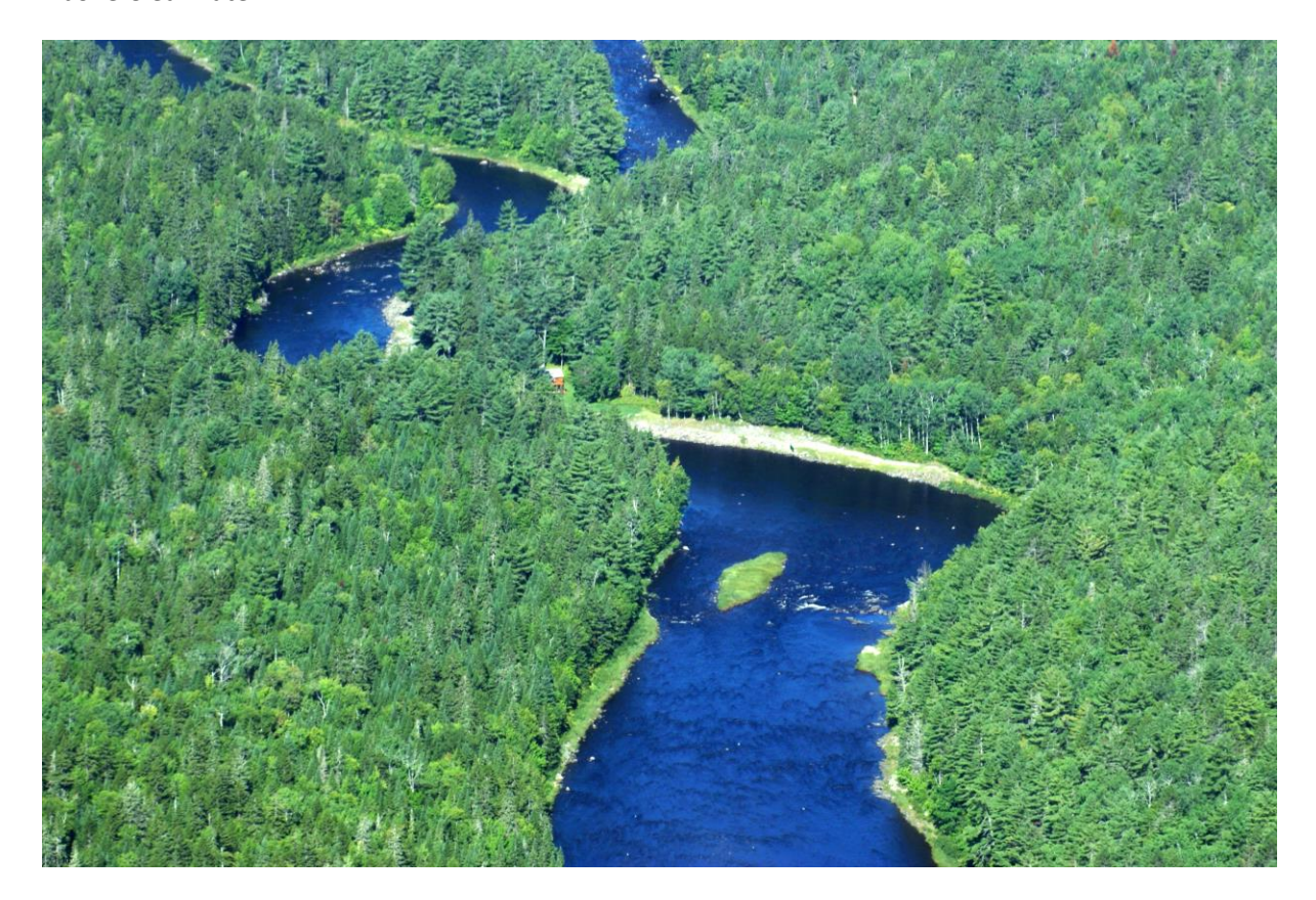
Burnthill Rapids and Burnthill Brook