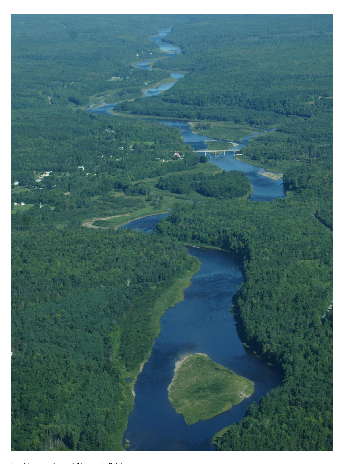
Looking up river at Norrad's Bridge.