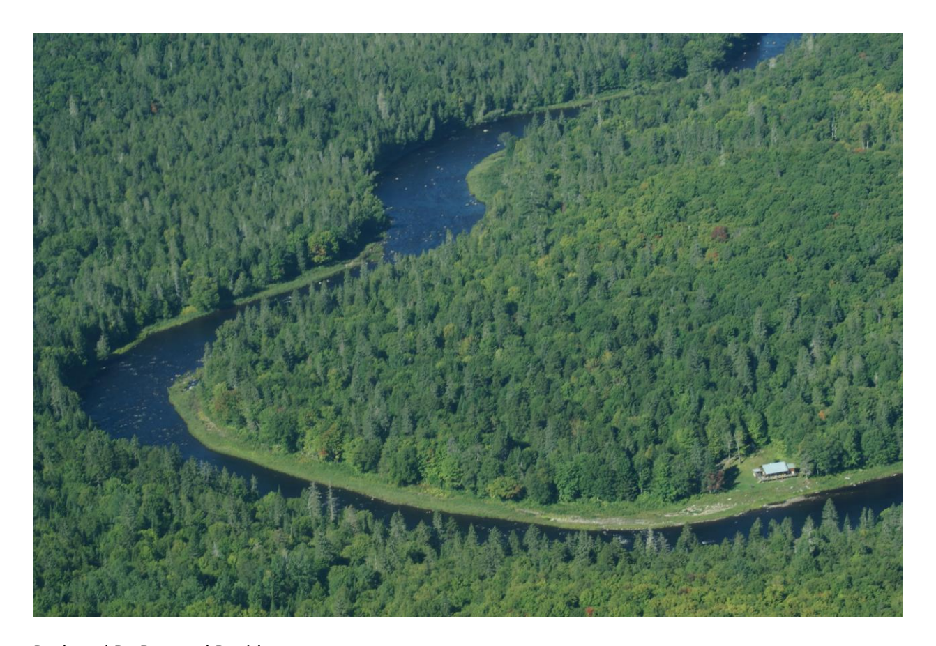
Push and Be Damned Rapids