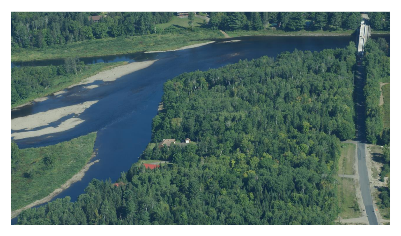
The bridge at Ludlow