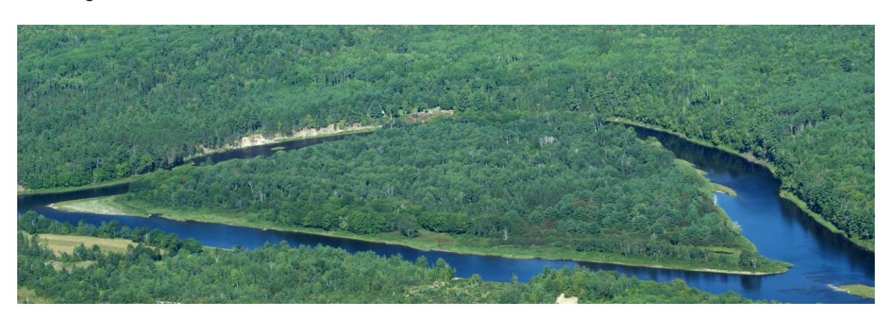
McCarty Island below Boiestown