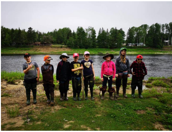
In this photo, First Cast participants enjoy a day on the Miramichi river.