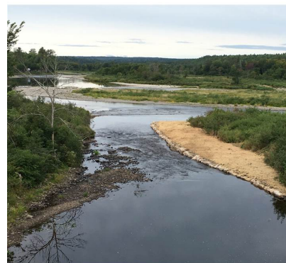
2018 Annual Report

Fun Weekend for all at the MSA's "First Cast" event