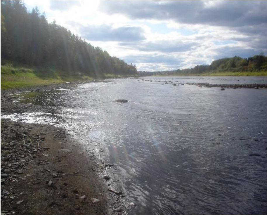
'The Rock' at Mountain Channel, late summer 2020